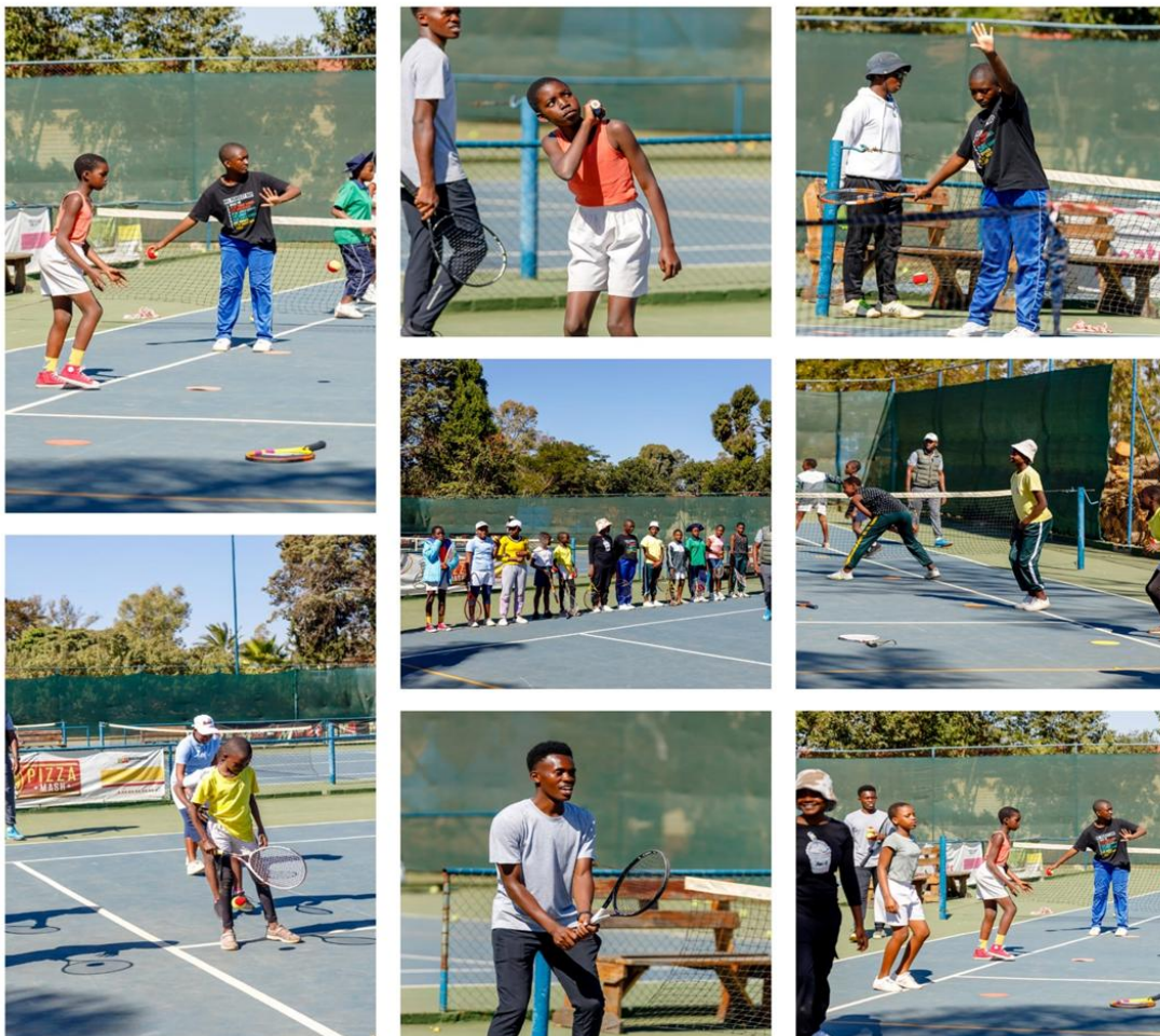
Tennis students at Baseline Tennis Academy at one of the sessions