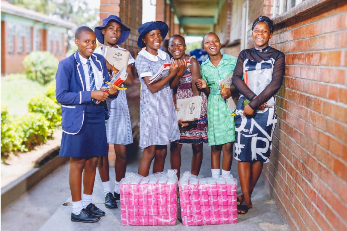
Students pictured at the beginning of the term, having received their school supplies

Tariro's holistic approach to educating and empowering young women and girls emphasizes the importance of psychosocial support and extracurricular offerings. Foremost among them, regular home visits with students and their families are integral in enabling our students to thrive academically and personally. In addition to regular home visits, our psychosocial and extracurricular offerings in 2024 included a tennis academy, an artificial intelligence (AI) workshop, our traditional music and dance group, and mentoring sessions.