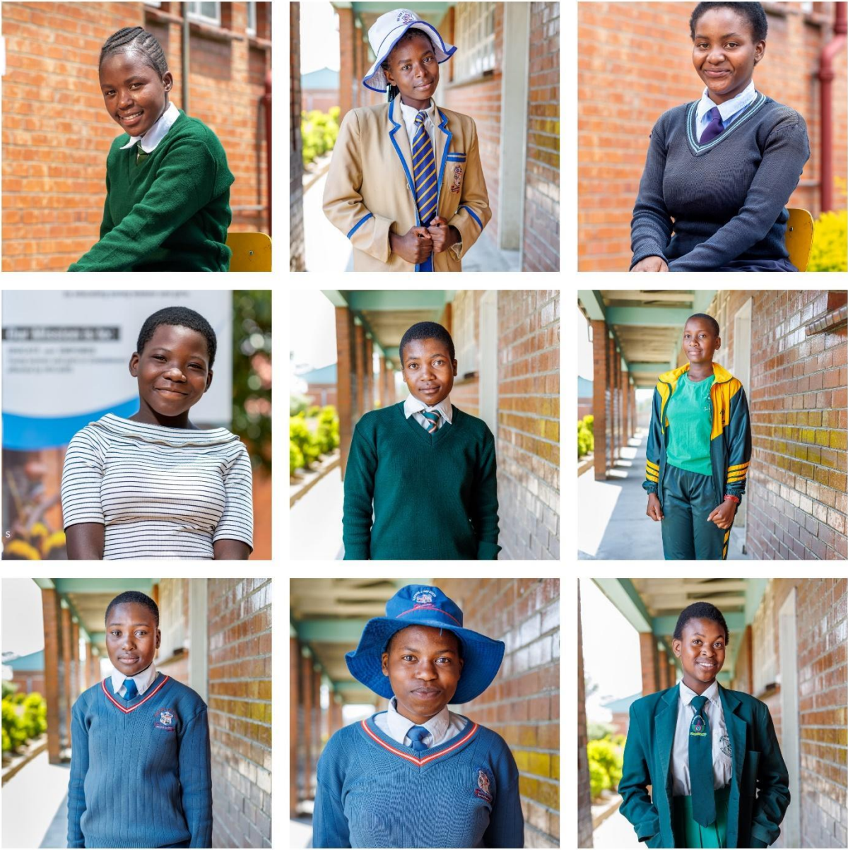
Some of Tariro’s 2023 secondary students