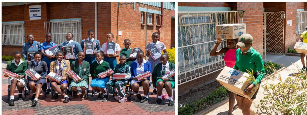
Students with their school supplies

Tariro’s holistic support includes distributing essential school supplies. In 2023, we distributed 619 feminine hygiene packs, ensuring that our students are able to attend school all month long. We purchased 12 new sets of uniforms, ensuring that all students had their required school clothes. Moreover, we provided 1,419 counter books, 480 exercise books, 144 pencils, 378 ballpoint pens, and 144 pencils to our students.