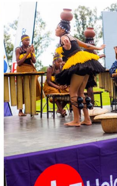
Ngoma YeKwedu in pictures