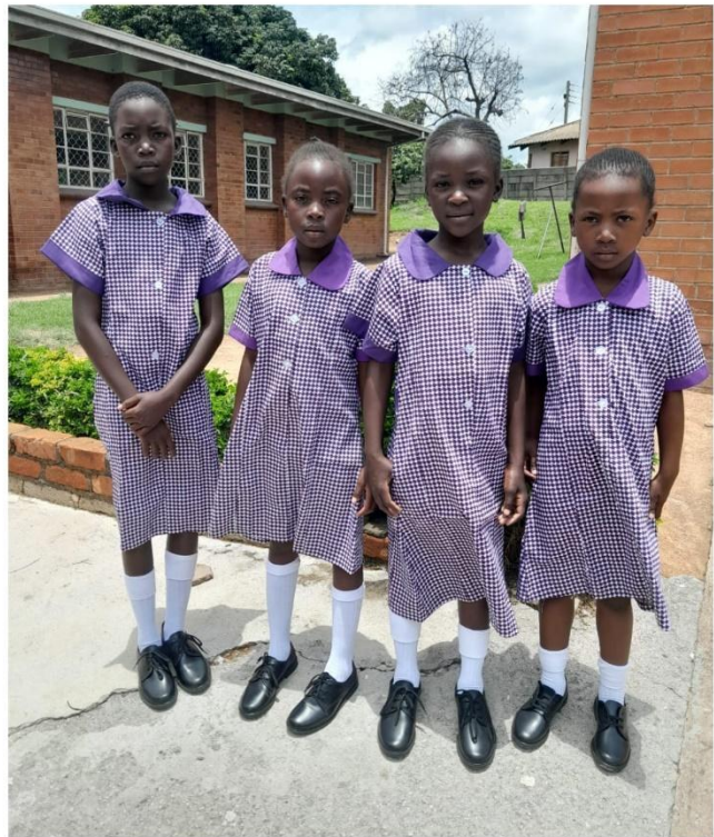
Newly enrolled primary students in their school uniforms

Tariro supported 25 primary school students in 2023, 15 of whom were new enrollments. Our enrollment efforts were concentrated on five primary schools: Rusvingo, Chitungu, Chembira, Kundayi, and Shiryedenga. All of these schools are located in Highfield and Glen Norah, which are adjoining low-income, high-density suburbs in Zimbabwe's capital city of Harare. Nine of our primary students sat for their Grade 7 Examinations in 2023, and all of these students have secured places to attend secondary school in 2024.