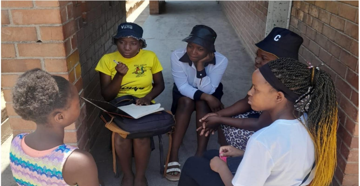
Members of the media club having a meeting

This year, Tariro began working on a media club to give our students opportunities to learn skills in media production. While this initiative is in its initial stages, our students have already begun posting content to Tariro’s social media pages. Looking ahead, we aim to further engage with educational institutions fostering collaborations with schools with existing media clubs, and facilitating visits to established media houses.