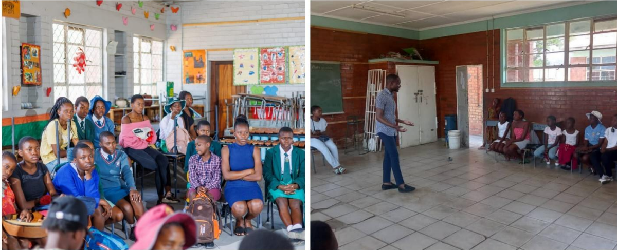
Mentorship sessions in action